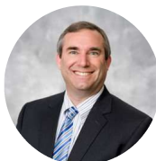
Wayne Dunn Consulting Contact