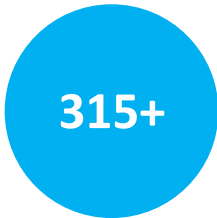
Partners & principals