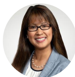
Magnolia Mabel Movido International Tax