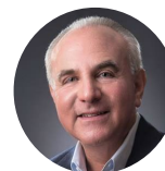
Mike Silver Sage Intacct