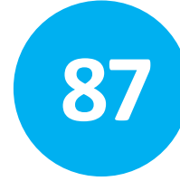
Net Promoter Score (NPS)